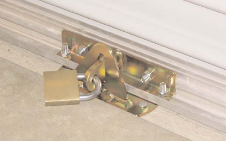
Model 2A For Rebated Concrete