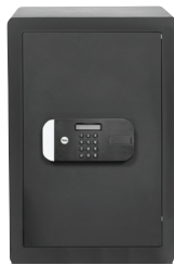
Maximum Security Motorised Safes